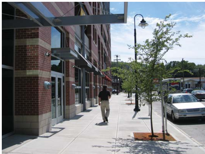
The ground floor of the garage incorporates retail storefronts on Cayuga St.

Trowbridge and Wolf prepared the overall redevelopment plan and developed detailed design and construction documents for the site work for three phases of implementation. TWLA was also responsible for the SEQR and site plan approvals.