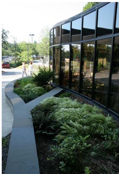
planting at the Garden Cafe