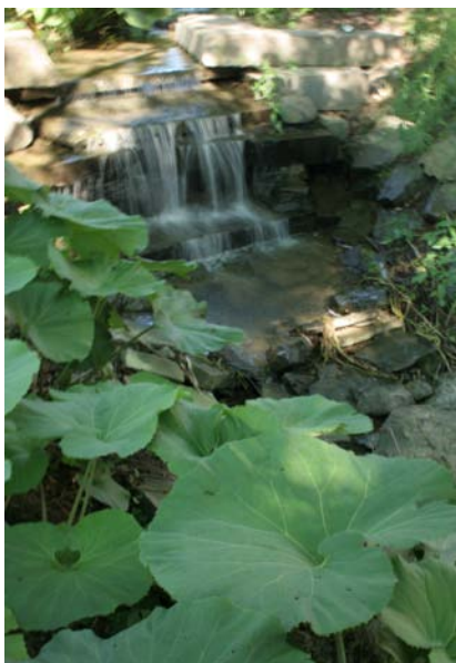
water feature for reflection