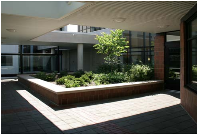
roof garden at the Radiation Oncology Center

The southwest Emergency Department Addition at the Medical Center is designed to attain LEED certification and includes a porous pavement parking lot, landscaped bioretention basins, development of garden spaces, and creation of a green roof.