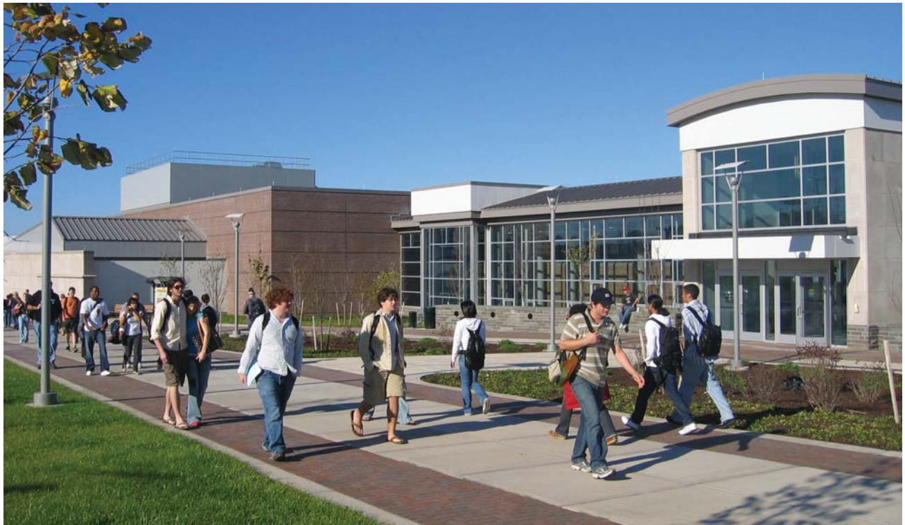
the pedestrian spine is a significant connector on campus

Trowbridge & Wolf prepared the design and materials standards of the pedestrian walkway that includes entrance plazas and a new vehicular dropoff to serve both Swetman Hall and the adjacent Campus Center, which hosts large campus events. As part of New York State's commitment to sustainability, the project was designed to achieve as many LEED points as possible.